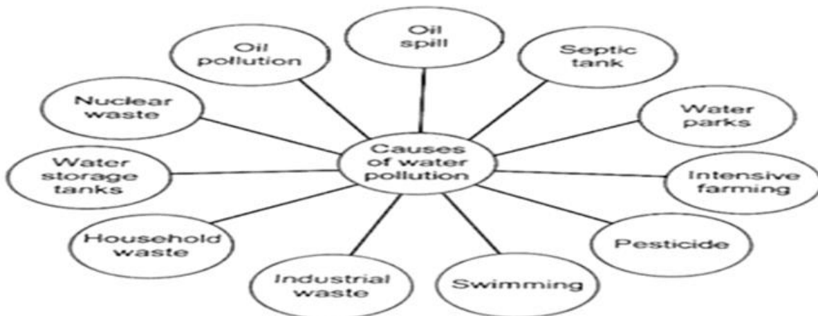
Major Causes of Water Pollution